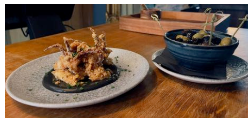
Above: tapas at No4, Below: The outside of No4