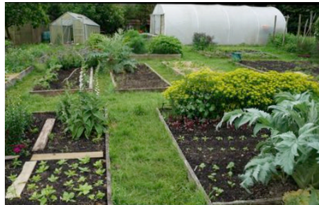
Above: Allotments in Wye Below: Sensory Garden in August 2023