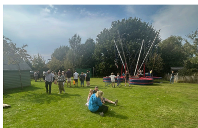
The Sun shone for the Fair!

Along with all the clubs and societies thanks to Caffeine and Fizz for coming and serving drinks for everyone and Mary and Penny for selling ice creams on a lovely warm September day. We hope to do this again next year!