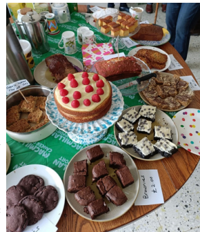
Right: 1 Chequers Park hosting a wonderful array of cakes for McMillan coffee morning