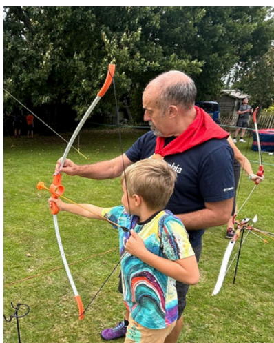
Thankfully the arrows didn't have any spikes