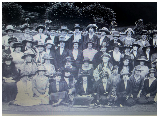
Wye WI members in 1922 pose for a photo

The purpose of the early institutes was to enable countrywomen to help with the war effort by preserving