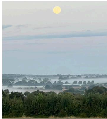
Left: Tamzin Denny sharing a full September moon over Wye