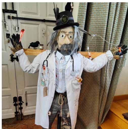
First place went to The Wooden Spoon Preserving Co

There is an Instagram account @wyescarecrowfestival that showcases the event for those unable to attend and the committee would like to express heartfelt thanks to all those who provided entries and the auction donors and buyers who gave so generously.