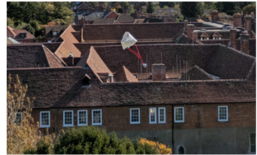
Storm Amy took one Teddy on a detour over the building work at the old college