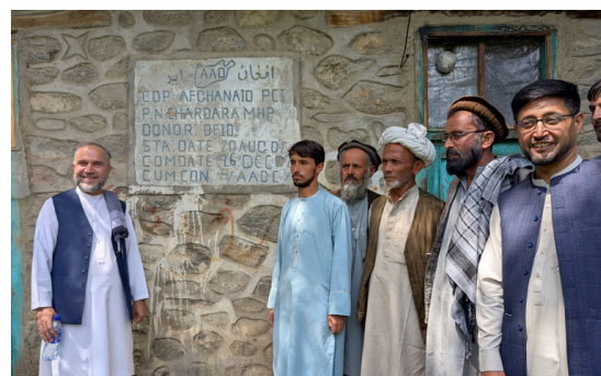
The financing from the UK Government has provided sustainable hydroelectricity in Badakhshan.

To find out more about Afghanaid please visit www.afghanaid.org.uk/