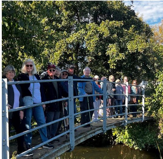
Left: Wye Walkers on Sparrow's bridge enjoying an Autumn walk

Capturing local sights, special moments and the charm of our village in pictures from the Our Place Wye Facebook Page: