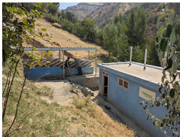
Clean water and sanitation facilities improve health and boost school enrolments..

I was visiting on behalf of a British organisation Afghanaid that has worked there since the 1980s. In August I saw the differences made in the lives of rural people of the north-eastern Province of Badakhshan through investments in land terracing, tree planting, infrastructure and skills development. A