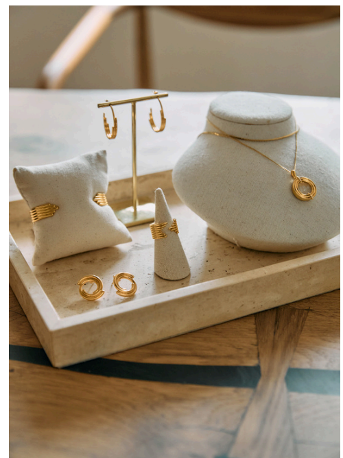
Rachel's new collection. Her jewellery is available online and in store at Selfridges.