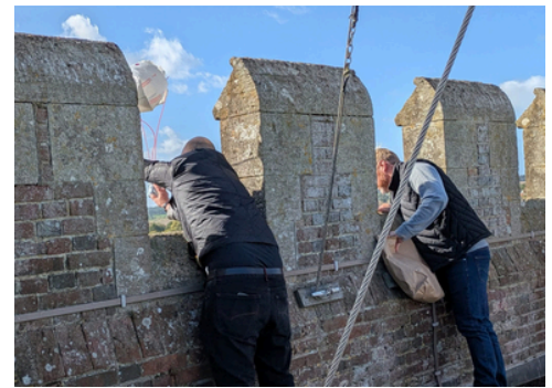
Teddy's being launched from the Church tower at the Teddy Bear parachute extravaganza