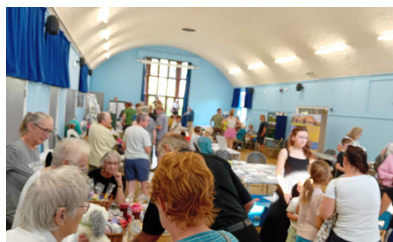
Over 250 people came in to speak to the clubs in Wye and see what was on offer